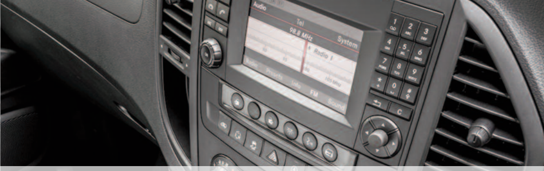
5.8" TFT display with integrated connectivity

The Mercedes brand inevitably prompts high expectations – and M8^{\text{\tiny IM}} certainly doesn't disappoint.